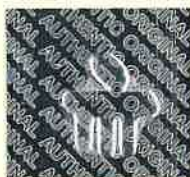
Assistant Registrar Student Evaluation